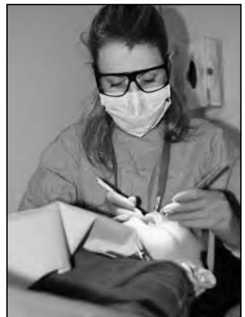
School Health Program Manager Community Health Center Jackson County School District #9